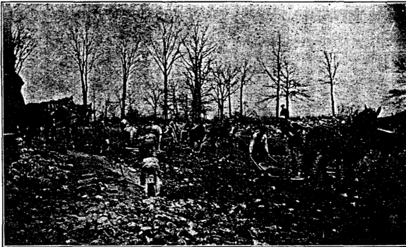
BREAKING GROUND FOR THE NEW BIBLE SCHOOL

Cries from destitute places in the homeland where hearts are hungry for salvation and the Baptism, cries so pitiful as to break hearts of stone, are now before us calling for workers who know the Word. We have no such trained, unemployed workers to send. God has done His part in calling them, and He is waiting on us to teach them and bid them His speed into the vineyard to reap for Him. Don't you want some part in this blessed work? Assemblies have grown and are wanting pastors, better trained in the Word so as to feed their souls and take them on deeper into God. The supply is too short to meet these needs. Let all these saints and assemblies give