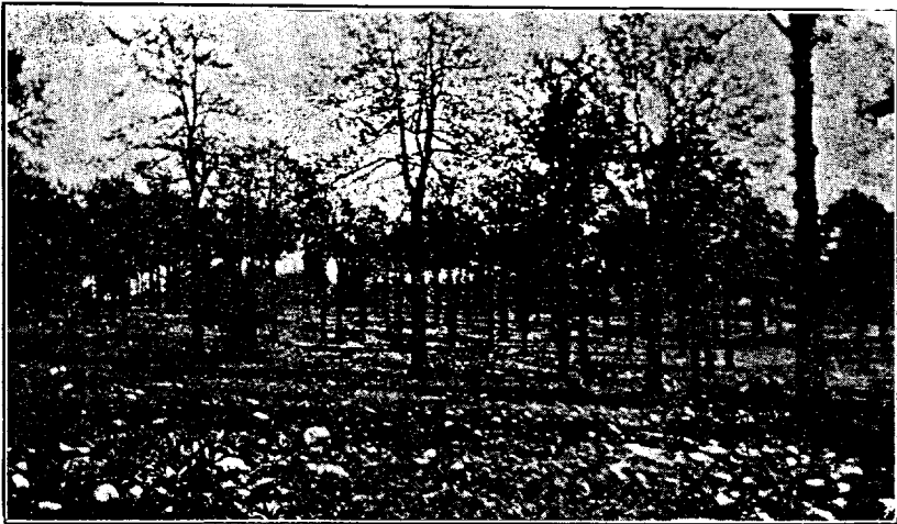
THE OAK GROVE IN WHICH THE BIBLE SCHOOL IS TO BE BUILT

Then it got badly out of fix, after years of service for God in folding Sunday school literature and Pentecostal Evangels. But now a new one is paid for and on the floor in the Gospel Publishing House. It is a dandy, runs with little noise, does accurate work, and puts out folded papers at the rate of 5,000 per hour.